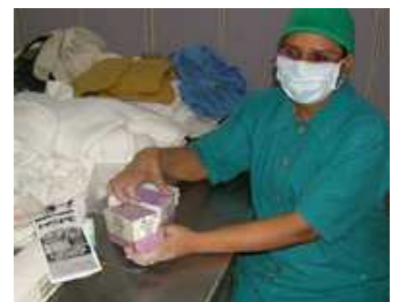
So happy to have sutures & other supplies donated by International HOPE