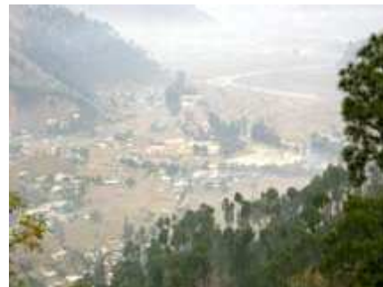
Looking down the valley one can see the devastation & the tents