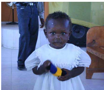
One of the many children seen by the Canadian team